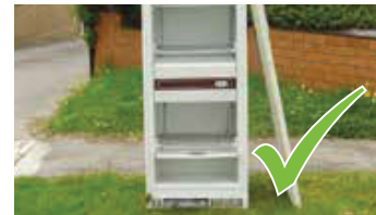
Washing machines, stoves and fridges with doors removed