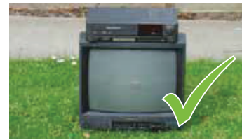
Electronic equipment such as TVs and DVDs