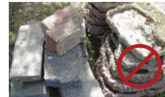
Building and renovation materials including cement sheeting or fences