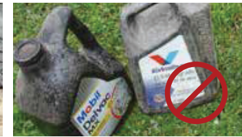
Motor oil and engine blocks