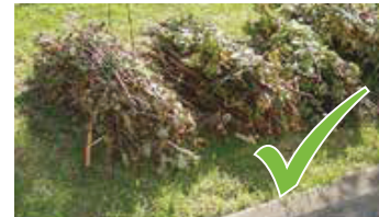
Branches and prunings (tied and separated from other materials) less than 1.5 metres in length