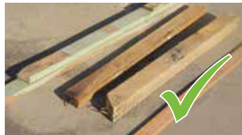
Timber (no longer than 1.5 metres and no more than 10 pieces)