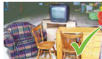
Furniture and household appliances (includes carpet, no more than three rolls that can be lifted by one person)

Your items will be collected by up to three collection vehicles to maximise recovery. All material collected (including compacted material) is taken to a materials recovery facility at Knox Transfer Station for storing and recycling.