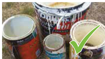
Paint tins (empty with lids removed)