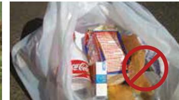
Household waste and recyclables