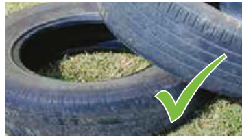
Car tyres (maximum four) No Truck tyres