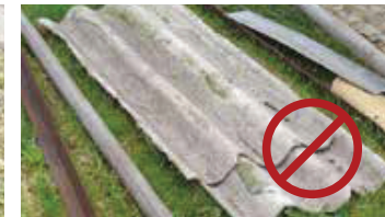
Asbestos and other hazardous waste