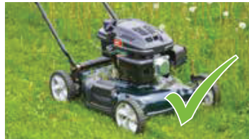
Scrap metal, car parts and lawn mowers