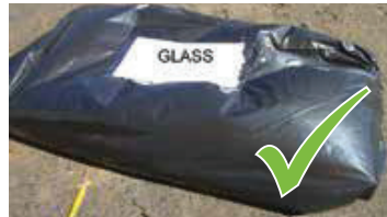
Glass and china (securely wrapped and labelled 'glass' or 'china')