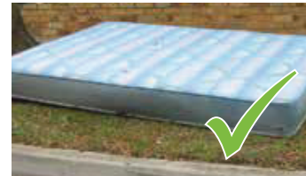
Mattresses and bed bases (maximum of two)