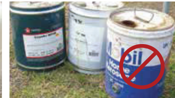
Dangerous goods including household chemicals and pesticides