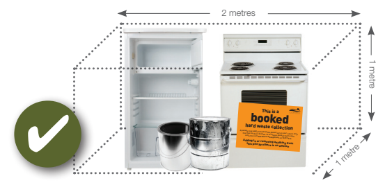
Example of 2 cubic metres of hard waste