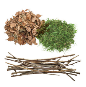
No garden materials