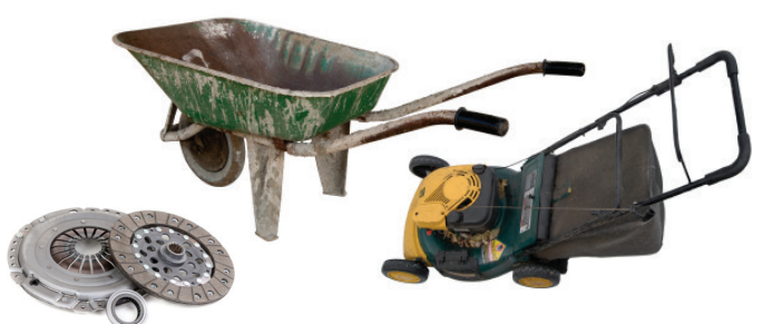
Tools, mowers and small car parts