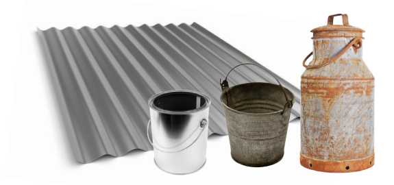
Empty and clean paint tins, scrap iron and other waste metal